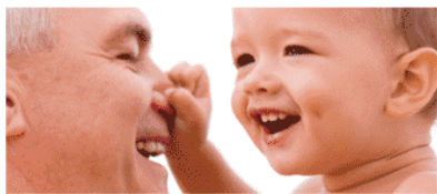
2009 Celebrate Life Festival